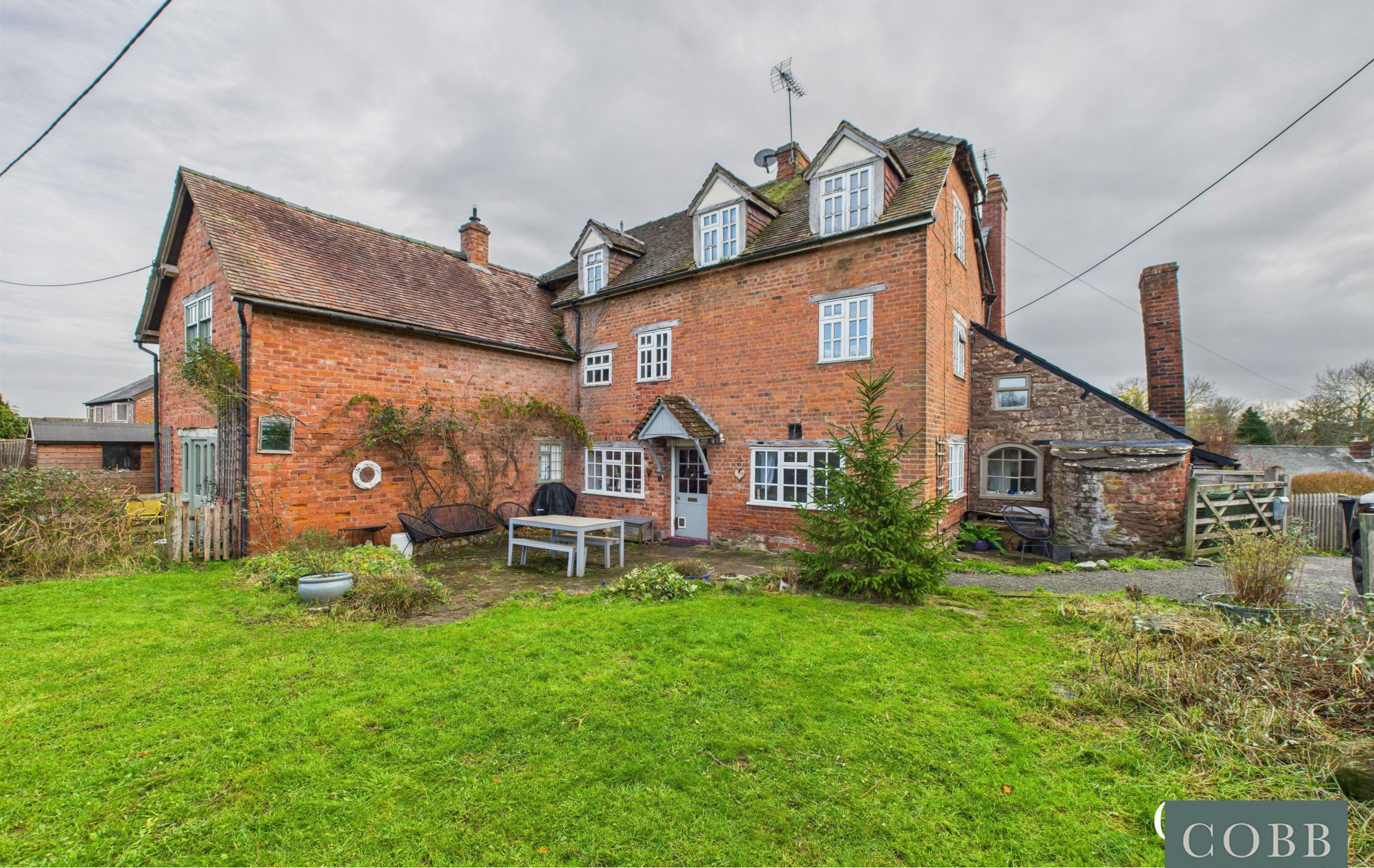
Granary Cottage, Eye Lane, Luston, HR6 0DU Price £375,000